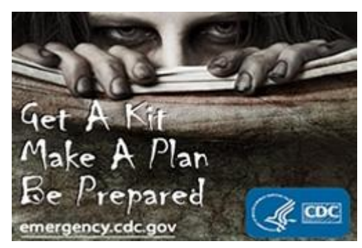
Get a Kit, Make a Plan, Be Prepared

If zombies did start roaming the streets, CDC would conduct an investigation much like any other disease outbreak. CDC would provide technical assistance to cities, states, or international partners dealing with a zombie infestation. This assistance might include consultation, lab testing and analysis, patient management and care, tracking of contacts, and infection control (including isolation and quarantine). It's likely that an investigation of this scenario would seek to accomplish several goals: determine the cause of the illness, the source of the infection/virus/toxin, learn how it is transmitted and how readily it is spread, how to break the cycle of transmission and thus prevent further cases, and how patients can best be treated. Not only would scientists be working to identify the cause and cure of the zombie outbreak, but CDC and other federal agencies would send medical teams and first responders to help those in affected areas (I will be volunteering the young nameless disease detectives for the field work).